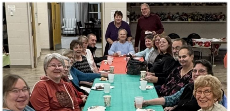
Members of PEUMC & NUCC gathered around a single table to enjoy refreshments & fellowship following our first Wednesday Lenten service of the year!