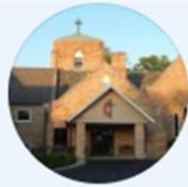
Port Edwards United Methodist Church Instagram

INSTAGRAM is owned by Facebook (now Meta Platforms), and both media platforms are very similar. However, INSTAGRAM excels at photos and videos with inspirational captions.